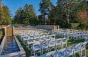
The Grand Garden