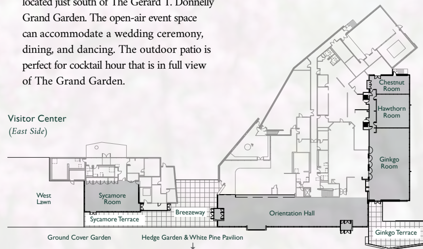
Visitor Center (East Side)

Celebrate your special day with an outdoor ceremony on The Morton Terrace followed by an indoor reception in the Arbor Room overlooking an expansive landscape and beautiful stone terrace.